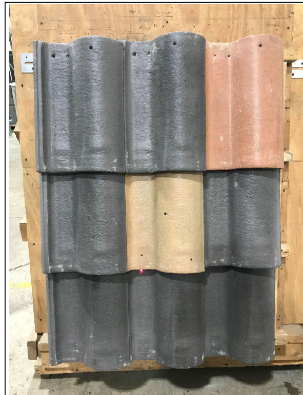
Photo No. 1 Test Deck, Overall View