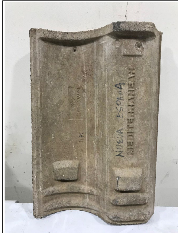
Photo No. 3 Impact Tile, Rear View