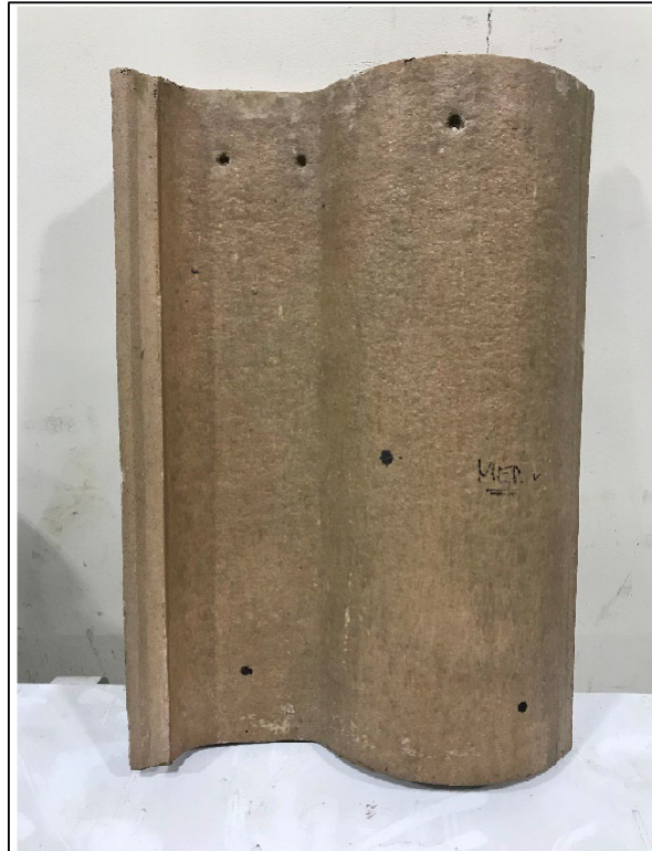
Photo No. 2 Impact Tile, Front View