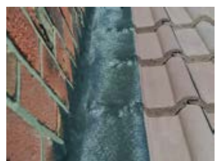
Easy Form Plus® is a highly flexible, lightweight and environment friendly universal flashing