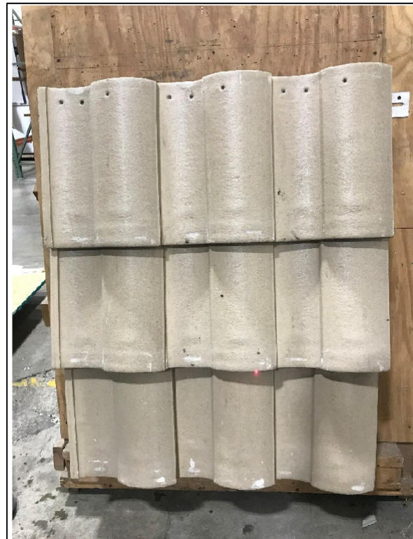
Photo No. 1 Test Deck, Overall View