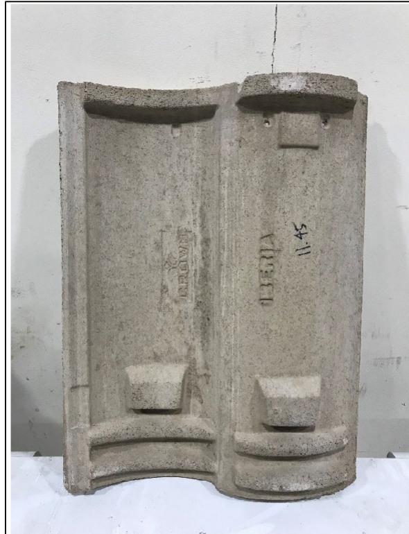
Photo No. 3 Impact Tile, Rear View