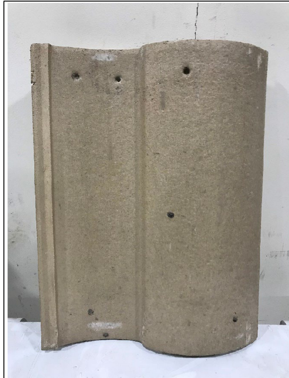
Photo No. 2 Impact Tile, Front View