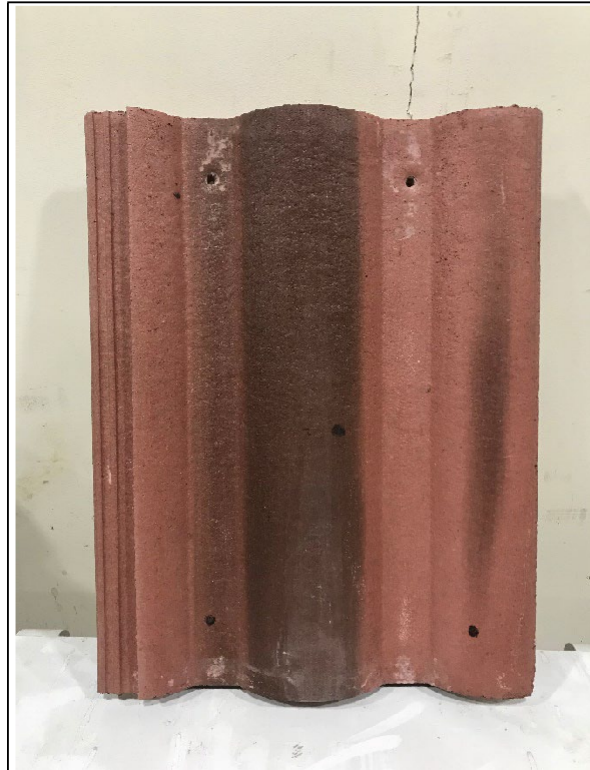
Photo No. 2 Impact Tile, Front View