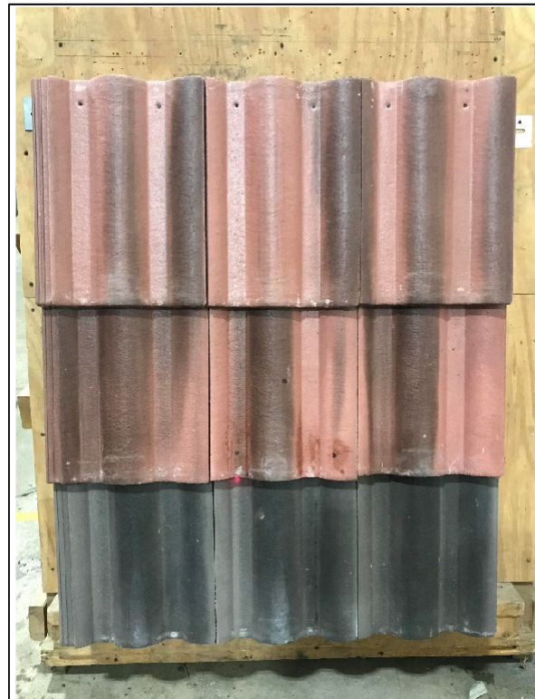
Photo No. 1 Test Deck, Overall View