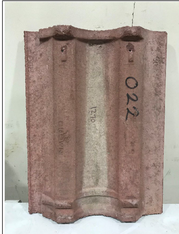
Photo No. 3 Impact Tile, Rear View